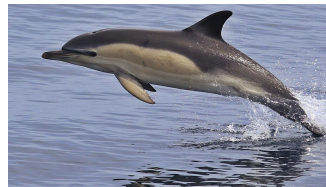
The CetAMBICion project proposes common measures to reduce cetacean bycatch in the Bay of Biscay and Iberian Coast sub-region