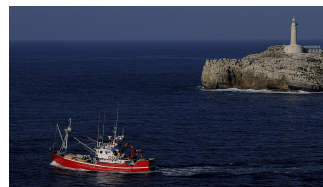
We assessed the fishing gears, areas, and seasons with the highest risk of cetacean bycatch in the Bay of Biscay